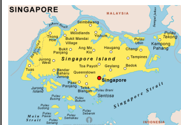
Map of Singapore

Did you know the monster fire Australia burned 449,000 hectares? This is seven times the size of Singapore.